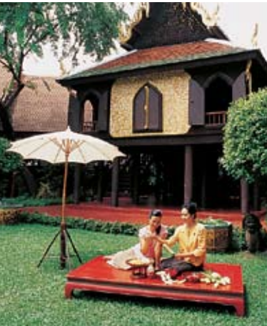
Suan Pakkad Palace & Museum

fortress. Altogether, there are 38 rooms for ammunition and weapons. The roof collapsed during the reign of King Rama IV or V, but was restored by the Fine Arts Department in the early 1980s using old photographs as a guide. Nowadays, there is a small park surrounding the fortress. Visitors can enjoy a pleasant walk along the Chao Phraya River all the way to Phra Pinklao Bridge.