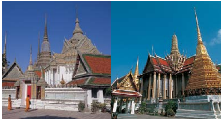
Wat Phra Kaeo