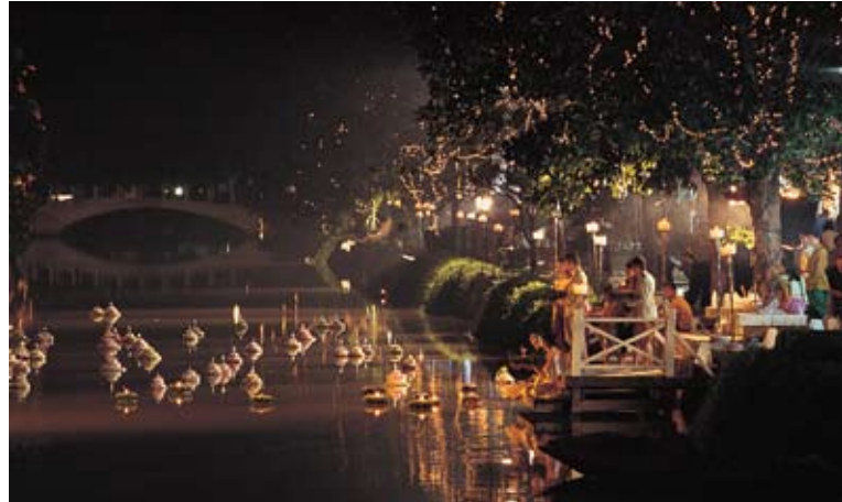
Loi Krathong Festival

do not fancy a soaking can always stay home.