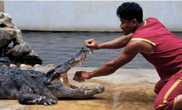
Samut Prakan Crocodile Farm

more than 60,000 freshwater and marine crocodiles and a mini-zoo also offers an exciting show of keepers playing with these dangerous animals. The farm opens daily from 7.00 a.m. to 6.00 p.m.