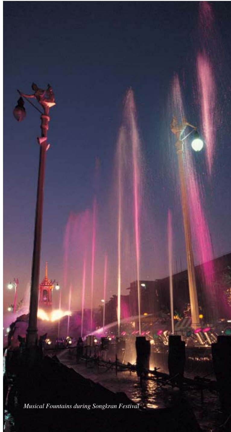
Musical Fountains during Songkran Festival