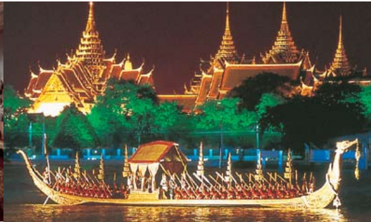
Suphannahong Royal Barge

for the Kathin Ceremony, a Buddhist tradition of offering robes to monks, usually held during October or November. There is also "Narai Songsuban Ratchakan Thi Kao", the latest royal barge especially built on the occasion of the Golden Jubilee of His Majesty the King's Accession to the throne in 1996. The royal barges were also used during the Rattanakosin bicentennial celebrations and the reception ceremony of the APEC 2003.