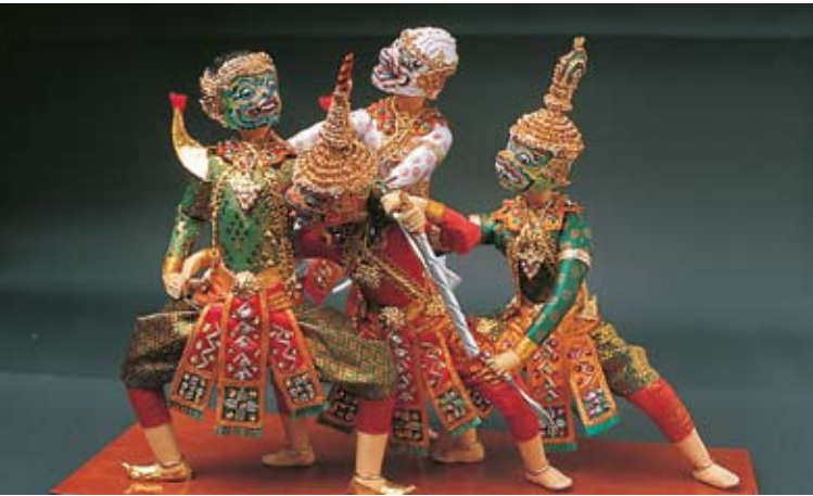
Bangkok Dolls Museum