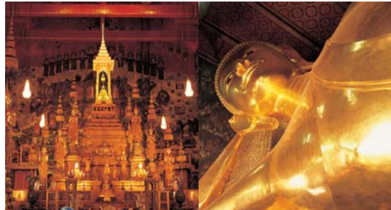
The Reclining Buddha, Wat Pho