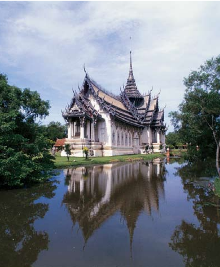
The Ancient City

Opposite the City Hall, this remarkable white pagoda, commonly called “Phra Chedi Klang Nam” as its original location was on an island near the river mouth, attracts visitors who enjoy the pagoda’s annual celebration, usually lasting nine days in October.