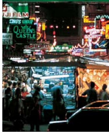
Patpong Night Bazaar