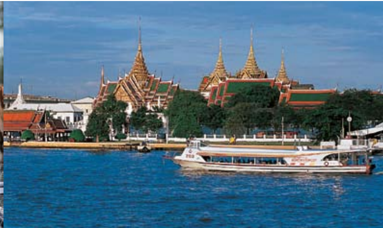
Chao Phraya River

Major sights to be seen from the river include the Temple of