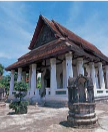
Wat Pho Bang-o