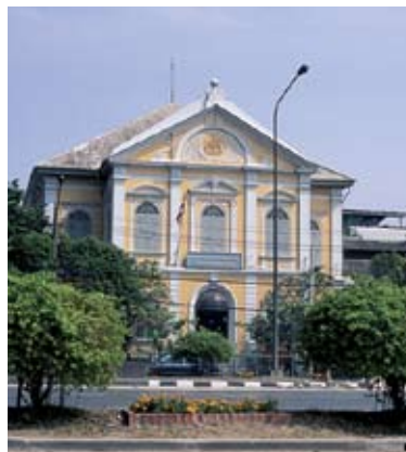
Bangkok National Museum