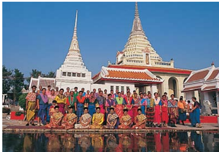
Phra Pradaeng Songkran Festival

Held by Bang Phli residents, this “Yon Bua” or “Tossing the Lotus” festival is a long merit-making tradition on the 14 th day of the waxing moon of the 11 th month (around October). Large crowds of people wait to toss lotuses onto a boat bearing a Buddha image, sometimes covered with a floral tribute almost up to the statue’s head.