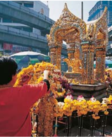
The Erawan Shrine