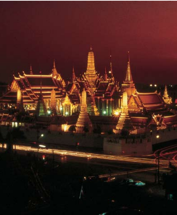
Wat Phra Kaeo