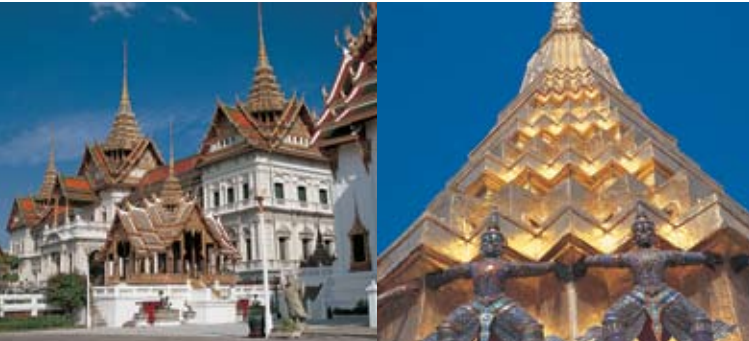
The Grand Palace