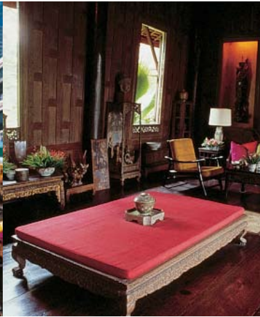
Jim Thompson's House

Located at No. 9 Krung Thep Kritha Road Soi 4, Bang Kapi in the eastern area of the city, the museum houses a vast collection of artefacts from prehistoric to Rattanakosin periods (from 1782 A.D. to the present). Within the museum complex, there are various styles of architecture, like a baroque building, a smaller replica of the Red Palace in the National Museum, and a replica of Ho Tri Klang Nam (Tri Pitaka Pavilion - a library for Buddhist scriptures) of Wat Yai Suwannaram. Prasat Museum is open daily from 10.30 a.m. to 3.00 p.m. except Monday, with an admission fee of 500 baht a person (in case of one person, a minimum admission fee of 1,000 baht will be charged). The tours run from 9.30 a.m. to 2.30 p.m. (about 2 hours) and must be arranged in advance. Tel. 0 2379 3601, 0 2379 3607