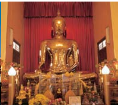
The Golden Buddha, Wat Trimit