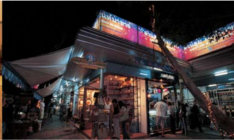
Suan Lum Night bazaar