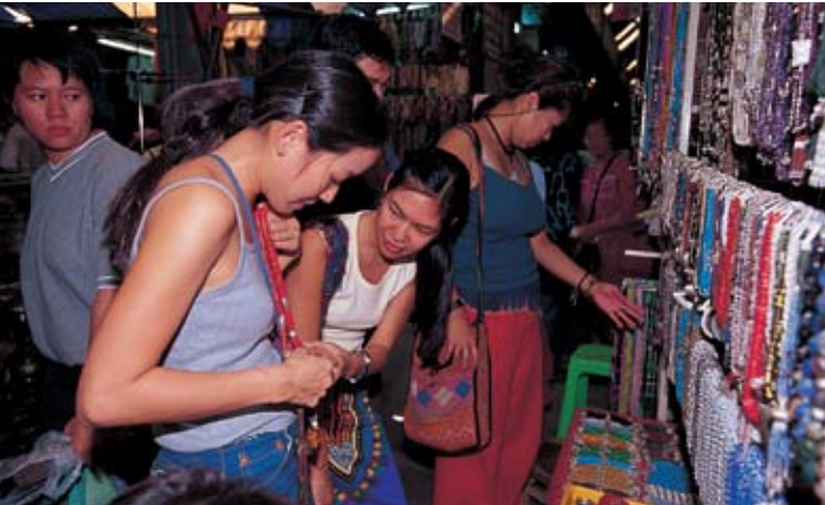
Chatuchak Weekend Market

intersection with Lan Luang Road. It is largely wholesale; therefore, bargaining is necessary if one is preparing to buy large quantities.